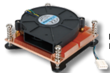
LGA1156 Cooler IEL P/N: CF-1156A-RS